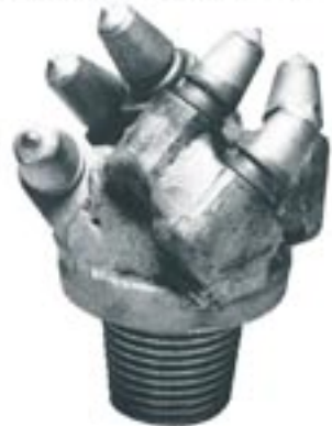
BT450 Replaceable Tooth Pilot Bit 2-3/8" API Thread