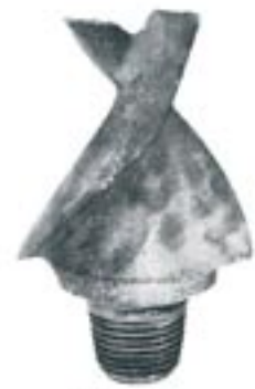
FISHTAIL Pilot Bit 2-3/8" API Thread

website: www.belltec.net e-mail: sales@belltec.net